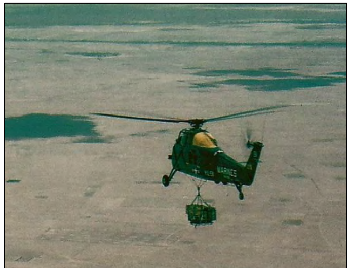
One of HMM-362s helicopters, with supplies slung beneath, flies from the USS Princeton into the Soc Trang airbase on April 15, 1962.