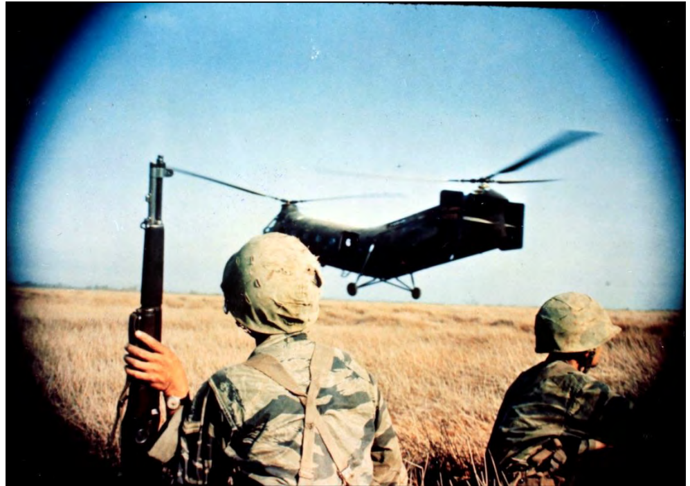
Vietnamese Marines wait to be picked up by U.S. Army CH-21 "Shawnee" troop-carrying helicopters during a recent operation in the Plain of Reeds area. Photo circa April 1963.

Contact us at: 1401 Wilson Blvd, Ste. 400 Arlington, VA 22209 Phone: 1- 877-387-9951 Email: vnwar50th@wso.whs.mil