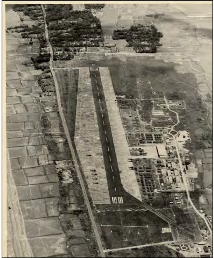
Soc Trang airfield, SHUFLY's base of operations during the early days of the Vietnam War.