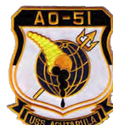
USS Ashtabula (AO-51)