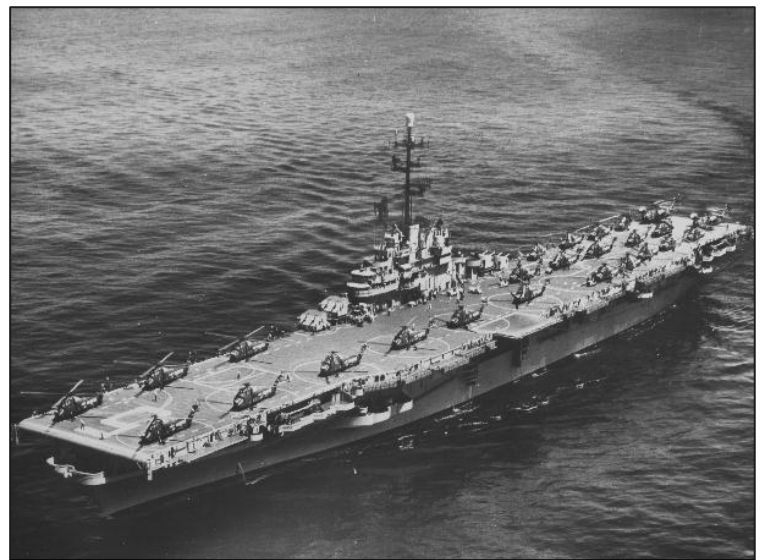
The USS Princeton (LPH-5) from which HMM-362 deployed to Vietnam in April 1962.

Former Army Chief Staff General Maxwell Taylor, then serving on Kennedy's personal staff, headed the most notable of these missions. Taylor, along with an entourage of White House, State Department and Pentagon officials, visited Vietnam in late October 1961. A report of the Taylor mission was presented to the president upon Taylor's return to Washington in early November. The report recommended increased military aid to South Vietnam in several areas, including providing aerial reconnaissance and air transport support, both fixed wing and helicopter, for the Vietnamese armed forces. The most far-reaching recommendation, however, was for the U.S. to offer to send military troops to Vietnam.