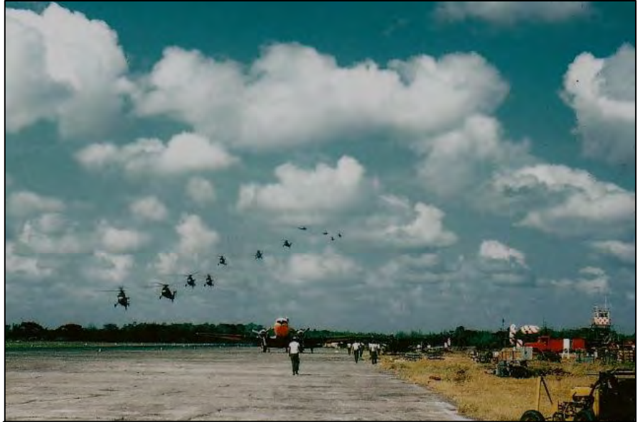
HMM-362 returns to the Soc Trang airbase following a mission during its 1962 deployment to Vietnam.