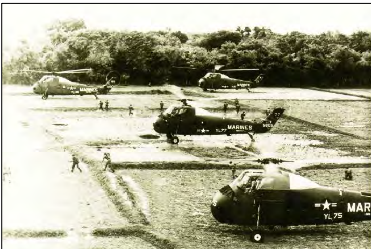
HMM-362 helicopters transport ARVN Soldiers into a landing zone during operations near Soc Trang in 1962.