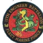
11 th Marine Engineer Battalion