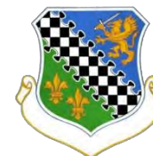
834 th Air Division