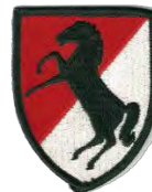
11 th Armored Cavalry Regiment