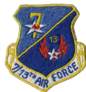
7/13 th Air Force