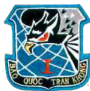
1 st Air Division Republic of Vietnam Air Force